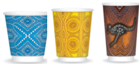
Indigenous Design Cups